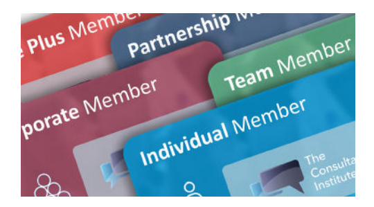
Pick your perk on renewal

Including informal coffee mornings for networking and shared learning, informative and topical webinars, and a series of in-person breakfast briefings designed to update members on current best practice and collectively discuss challenges to raise the standards of public consultation and engagement.