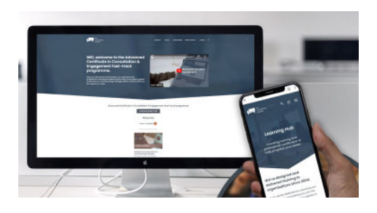
Professional Certificates Discount

Members can proudly display their tCl badges on their website and email signatures to showcase their affiliation and commitment to the Institute.